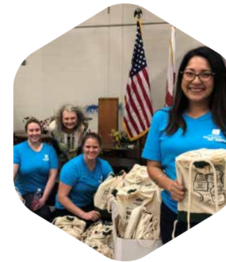
Thank you to our Junior League of Tallahassee volunteers for packing Summer Challenge bags with our team!

As a Ready To Learn grant station, there are many amazing projects we take part in within our community. One of these projects, Classroom Connection (a Tallahassee Chamber of Commerce Initiative), builds a solid foundation in early learning for children ages 0-5.