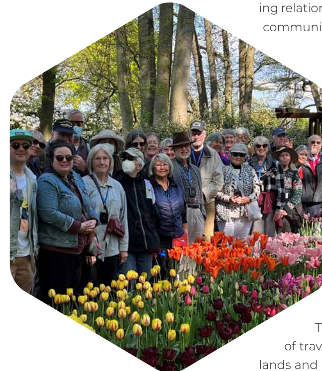
Pictured: WFSU Travel Club in The Netherlands, 2022

The travel program helps WFSU to forge relationships with members and donors who value world history, culture, and education, akin to the programming topics WFSU strives to provide.